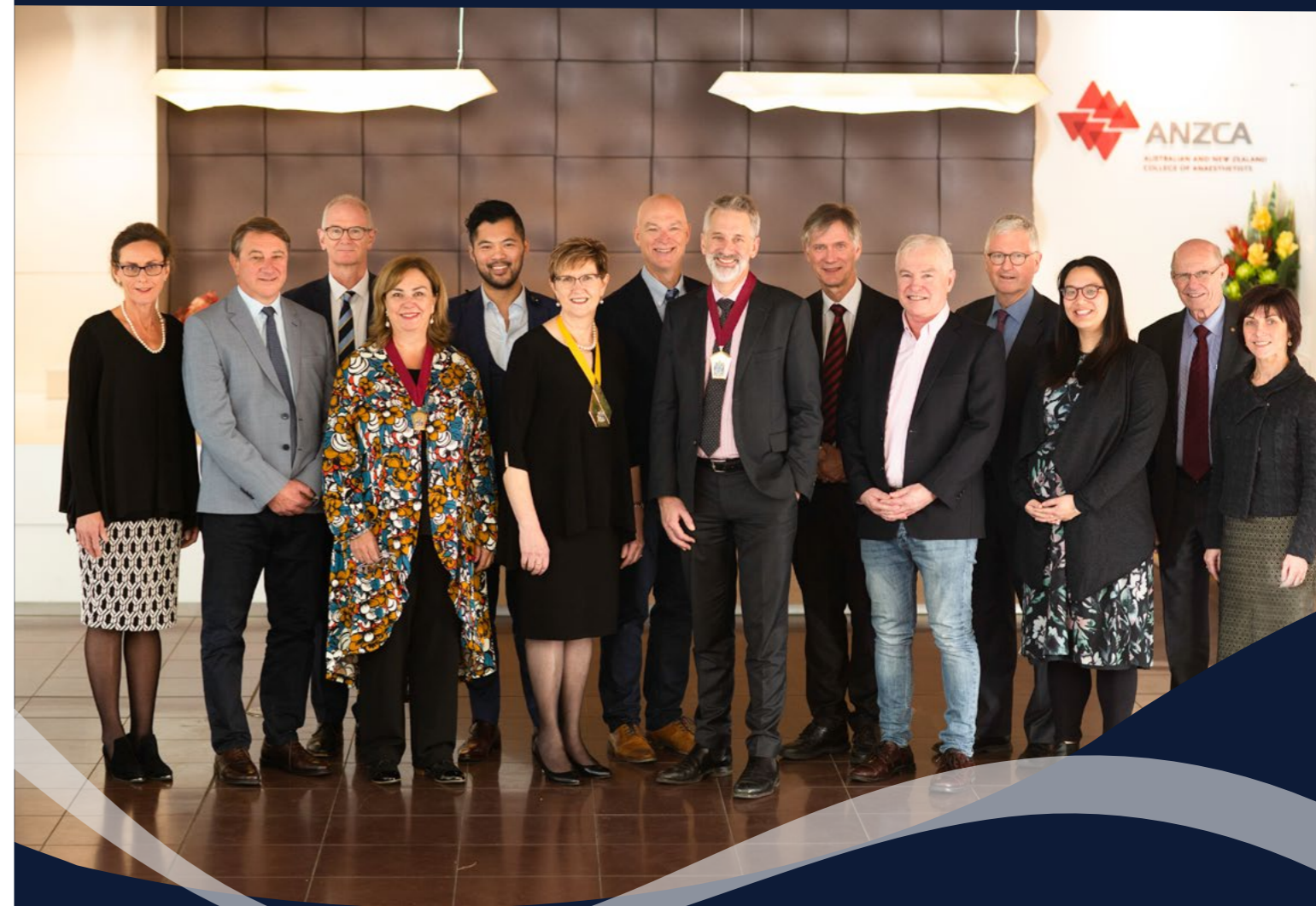
ANZCA Council, from left: